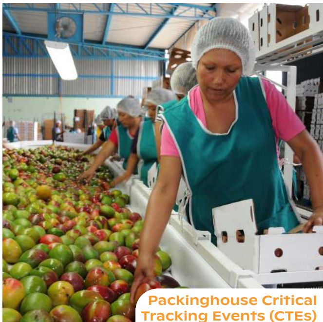
Packinghouse Critical Tracking Events (CTEs)

1. Initial Packing. - One of the main two Critical Tracking Events (CTEs) in a mango packinghouse is the initial packing of the product. Products are generally grouped into boxes or other packing materials and then onto pallets. This grouping of products will move together and can be traced by the lot or batch number assigned to the products. Note that the Rule doesn't require each box to be individually numbered; you assign the traceability lot code for the entire lot in accordance with your procedures to make tracking of where the product came from and where it is going more manageable.