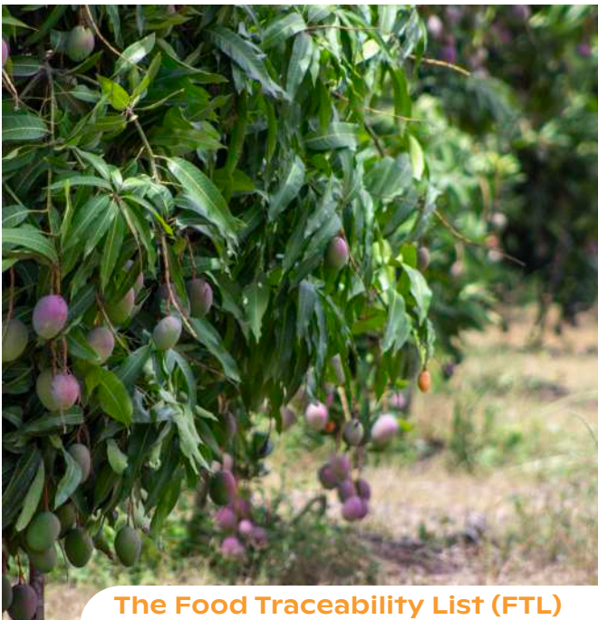
The Food Traceability List (FTL)

To determine which foods should be included on the Food Traceability List, the FDA developed a risk-ranking model for food tracing. The model scores commodity and hazard pairs (for example mangos and Salmonella spp.), according to data and information relevant to the following criteria: