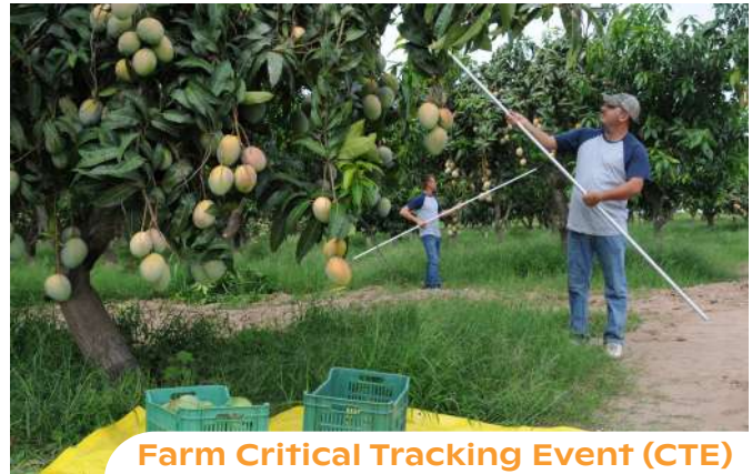
Farm Critical Tracking Event (CTE)

1. Product Harvesting. - The main Critical Tracking Event (CTE) that takes place at a mango farm is product harvesting: this is the point of origin of the product and is the furthest back you can go without losing the identity of the edible product. The illustration below shows the related Key Data Elements associated with this Critical Tracking Event. These will be explained later.