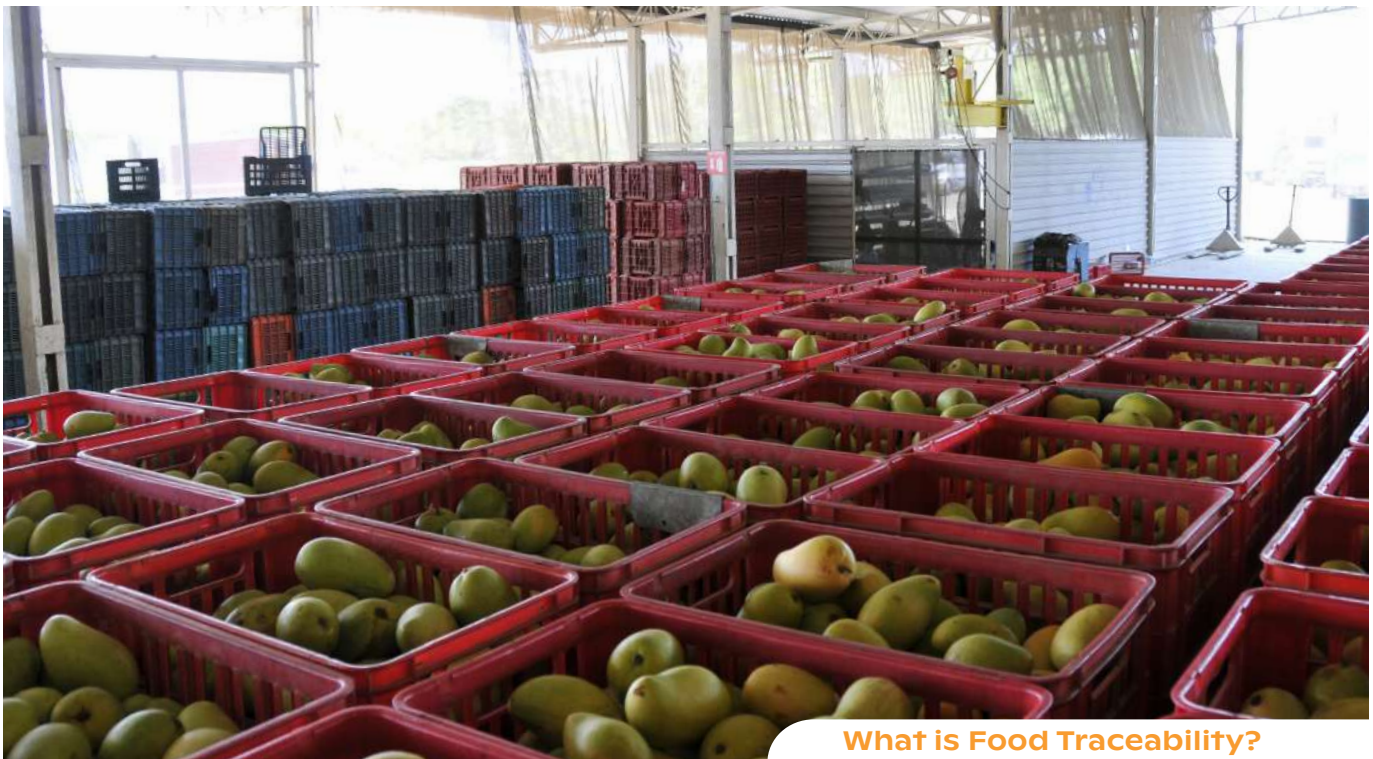
What is Food Traceability?

To achieve this, traceability requires the communication and cooperation of everyone involved in the supply chain and requires the recording and maintenance of detailed information about the origin, processing, and handling of the food.