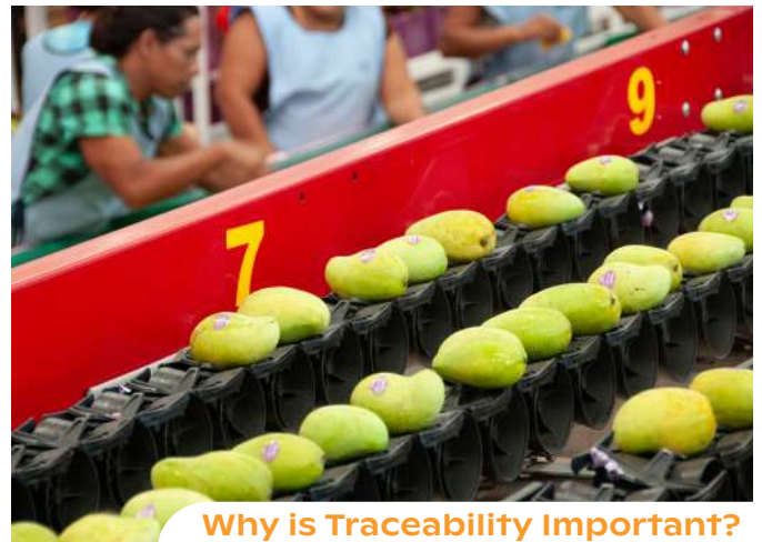
Why is Traceability Important?

In summary, a food traceability program is an important tool for ensuring food safety throughout the supply chain, that may also have other benefits to consumers, businesses, and regulators in the food industry.